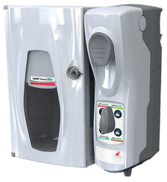
DOSIFROG CABINET 4P + DOSIFROG CABINET 4P STANDOFF