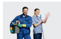
Personal Protective Equipment