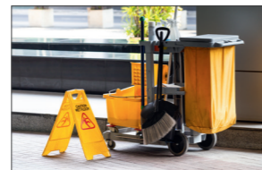
Safety in the premises