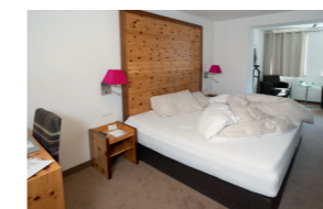
Cleaning a Hotel Room

In 18 courses we train your employees in the efficient and sustainable cleaning of different areas. Your personnel learn about the right equipment, suitable products, required dosages and the correct order and execution of work steps for each space to be cleaned.