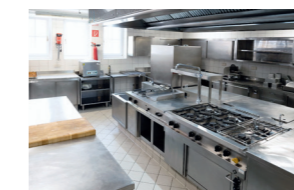
Cleaning a Kitchen