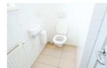
Cleaning a bathroom/toilet

The complete overview of all courses offered in Level 2.