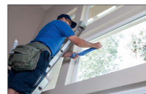
Ladders and steps