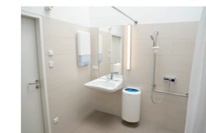
Cleaning a Hospital Bathroom