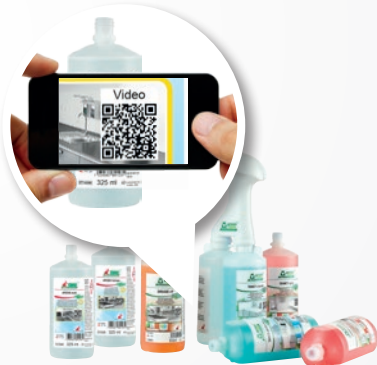
Direct access to application training via QR code