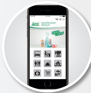
Choose training videos per application area

Digital Training Platform soon available at