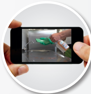
Watch training video from all mobile devices