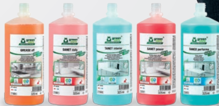
Quick & Easy green-Effective ® range